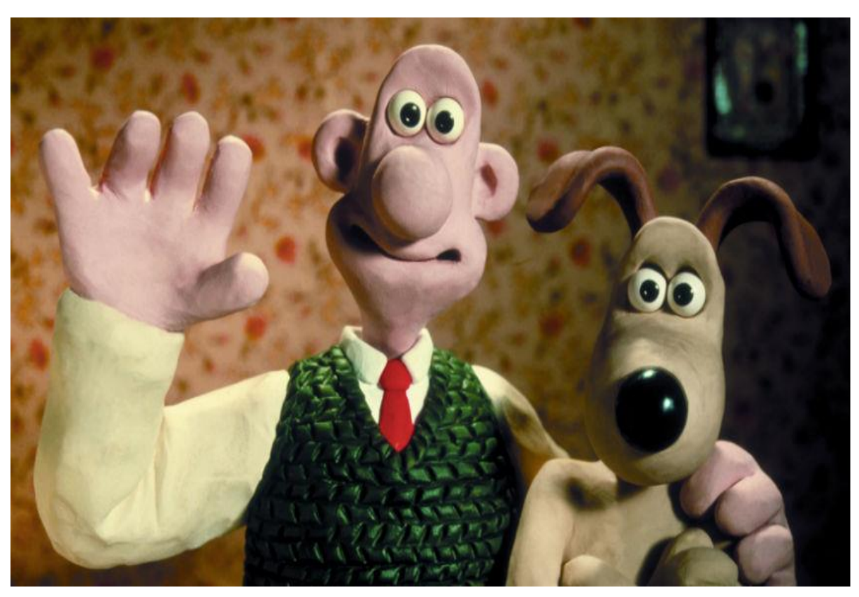
Figure 1.3: Stop Motion