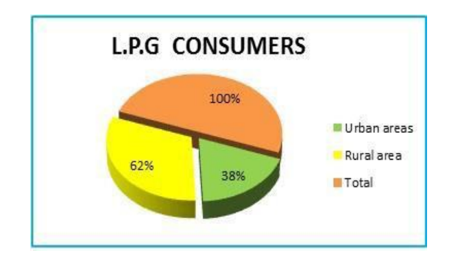
Fig 1: It represents total number of consumers of L.P.G in India (millions)

The biomass resources can be taken as organic matter in which the energy of sunlight is stored in chemical bonds. When the bonds between adjacent carbon, hydrogen and oxygen molecules are broken by digestion, combustion or decomposition they release their energy that is stored in chemical form. Biomass has always played a vital role of energy production by food and animal wastage. Now a days 10-14% of energy comes from it that is supplied to our country [2, 13]. The present time uses of biomass in India is calculated about 500 million metric tons per year. Data presented by the