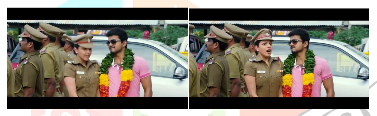
ICON 3 & 4

About turn. Nee enna anniki thottela, inikki en turn.