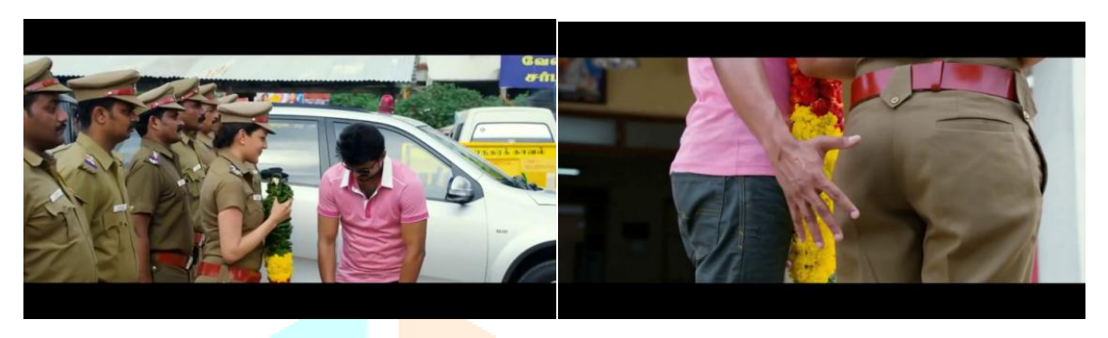
ICON 1 & 2

At that time, he instructs the Police parade to turn around and touches her back and says that you touch me now it's time for me. She can't react and is really shocked.