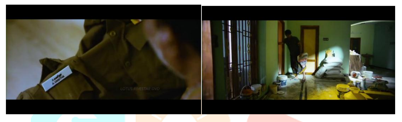
ICON 7 & 8