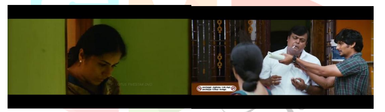
ICON 9 & 10

Her father also accepts and signed bond for the transfer. This whole scene in the film explains the fact that there is no security for women in working place, even she being a police guard or a police officer. The working nature of a police is very stressful thing for women these scenes in the films justify certain realities. This scene has shown women kidnapping and blackmailing is so usually happened in the society. These kinds of scenes portray the problems that women face. Finally when she was released, she was given a new dress by the goons, until then she was nude and locked in a room. After her father signed the bond the new dress is given and is not a police uniform. Even after that ordeal they are threatened by the antagonist.