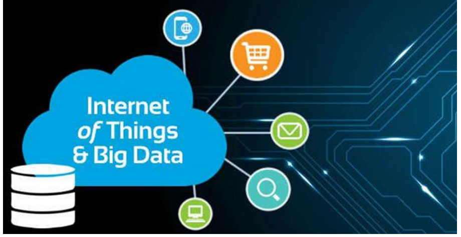
Fig 1. Overview of Big data and IoT