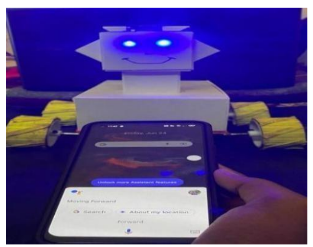
Fig 3: Voice Result