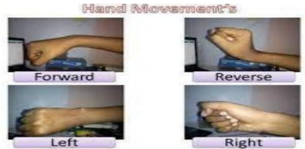
Fig 2: Commands for Gesture control

The accelerometer in a gesture-controlled robot records hand motions and delivers the information to a comparator, which assigns suitable voltage levels to the recorded movements. The data is subsequently passed through an encoder, which prepares it for RF transmission. The user's hand movement is identified by the device in our hand, and the robot moves accordingly. When we place our hand in front of the robot, it begins to move forward and continues until the next order is delivered. When we move our hand backwards, the robot changes its state and begins to move backwards until another order is issued. When we tilt it to the left, it will turn left till the next order is given. When we move our hand to the right, the robot moves to the right. The accelerometer is a threeaxis acceleration measuring device with a range of +-3g. To measure acceleration, this gadget uses a polysilicon surface sensor and a signal conditioning circuit. This device's output is analogue in nature and proportional to acceleration. When we tilt this instrument, it measures the static acceleration of gravity. And produces a motion or vibration as aresult.