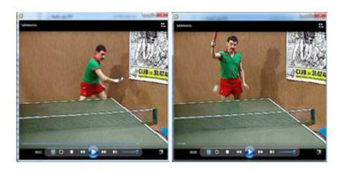
Fig. 1: Change of Object Position in Video

LBP is well suited for applications that need fast feature extraction and texture classification. this technique have exclude power and simple computation, the LBP texture operator has become a well known approach in many applications, including visual examination, image regain, remote sensing, analysis of biomedical image, movement analysis, military to identification of enemy and in many appliances analysis. During the past decades, local binary patterns have more interest in image processing and computer vision. The LBP gives local structures of images efficiently by comparing each pixel with its surrounding pixels. The most important characteristics of LBP are its resistive power to monotonic illumination changes and its simplicity of computation. LBP was actually proposed for texture analysis it's powerful approach to describe local structures effectively and efficiently [11].