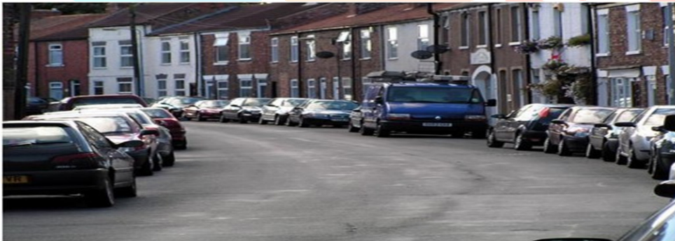
Figure No.1 : On Street Parking

On street parking means the vehicles are parked on the sides of the street itself. This will be usually controlled by government agencies itself. Common types of on-street parking are as listed below. As per IRC the standard dimensions of a car is taken as 5× 2.5 m and that for a truck is 3.75× 7.5 m.