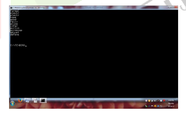
Fig 3: stemmed Words

Shows the normal number of variation expressions of various conflations aggregate that are stemmed accurately to the root words. To figure AWCF, we initially process the quantity of particular words after conflation.