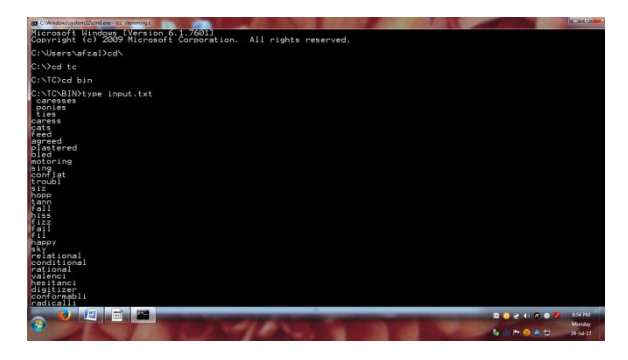
Fig 1: input text file

The file pressure factor speaks to percent by which a gathering of unmistakable words is lessened by stemming. Higher the quantity of words stemmed, more prominent the quality of the stemmer. The level of words that have been stemmed by the stemming procedure out of the aggregate words in an example. Bigger the quantity of words stemmed, more prominent the quality of the stemmer.