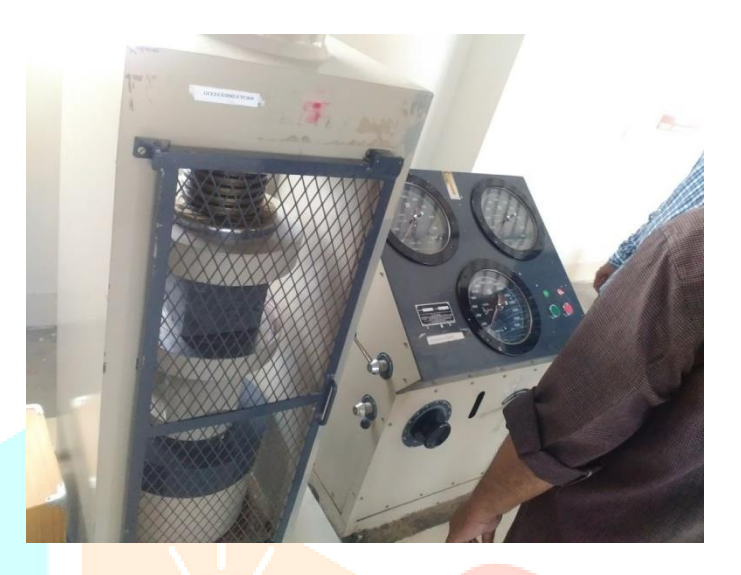
Fig. Compression testing.

Out of many tests applied to the concrete, this is the outmost important which gives an idea about all the characteristics of concrete. By this single test one judge that whether concreting has been done properly or not. For cube test two types of specimens either cubes of 15cm x 15cm x 10cm x 10cm x 10cm depending upon the size of aggregate are used. For most of the works cubical moulds of size 15cm x 15cm x 15cm are commonly used.