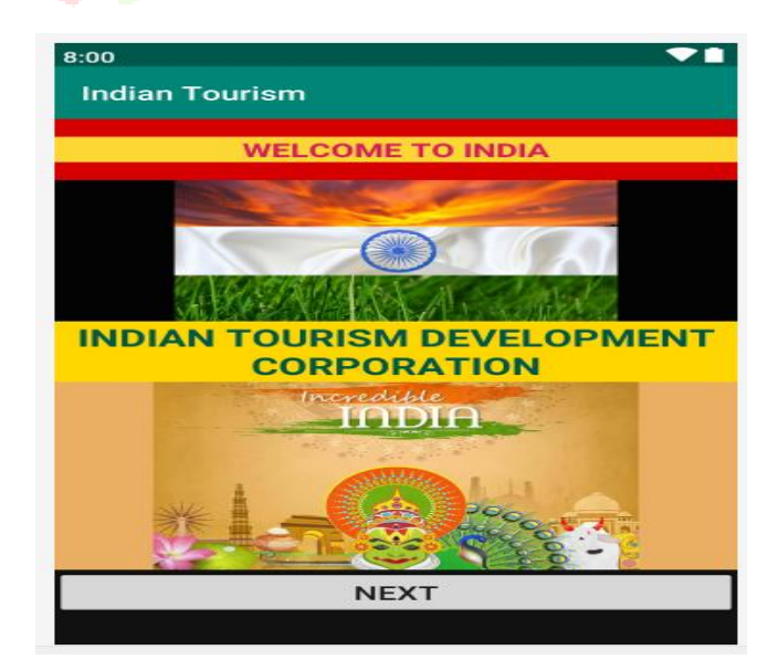
Figure 7.1. Icon of Application

Icon of application is First Impression of the application. So that First activity is the logo of application. Then second activity is should be shows states in India. So user can select our favourite state and see our tourist place favourite state and see our tourist place.