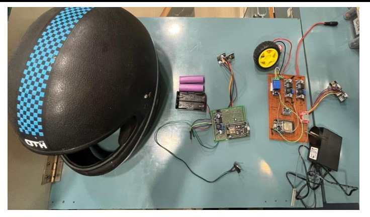
Figure 3. Hardware model of the project

If the vibration sensor detects any kind of vibration, the bike turns off and sends a message via the GSM unit, assuming that the person on the bike has fallen down. It also sends the location in that message via GPS to the number saved in that GSM unit. The helmet unit contains a speaker and microphone built inside it and is wirelessly connected to a mobile phone. The mobile can be controlled and commanded by voice. While riding the bike, when a call comes in on the mobile phone, we can receive or reject the call using only voice commands. To enable this feature, we need to make some additional settings on the mobile so that we can assist the mobile using only voice commands. We can enable permission settings on the mobile phone so that we can control it from the helmet.