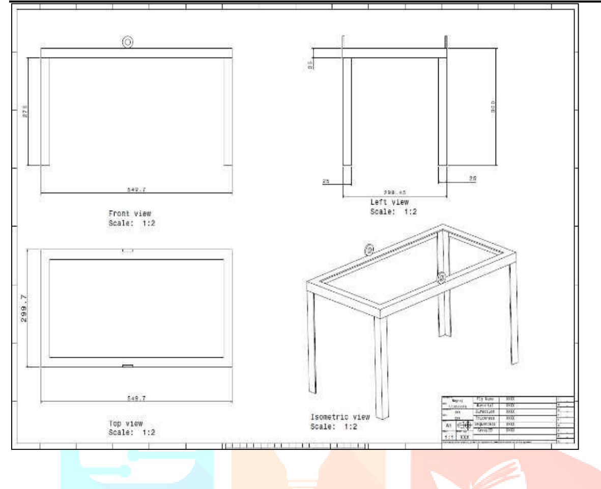
Fig. 2: Frame with Dimensions in mm