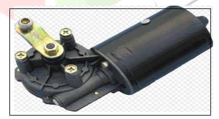
Fig. 3: 12 volt, 100 rpm geared DC motor

A DC motor is any of a category of electrical machines that converts electricity wattage into mechanical power. The foremost common varieties have confidence the forces made by magnetic fields.