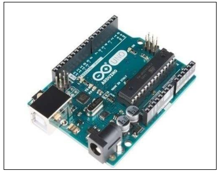
Fig. 4: ARDUINO UNO microcontroller