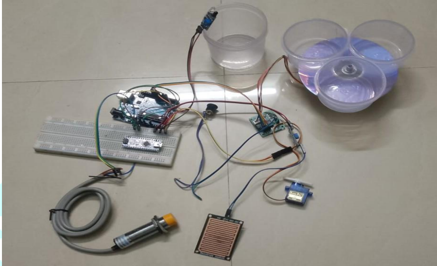
Fig. 2: Hardware Prototype of SensorFusionBin for Automated Wet, Dry, and Metallic Waste Segregation

The experimental prototype integrates an Arduino Uno, moisture sensor, metal detection sensor, servo motor, and waste collection containers to perform automated waste classification and segregation. The hardware setup validates the real-time operation of the proposed system by detecting waste characteristics and directing materials into the appropriate collection compartment with minimal human intervention.