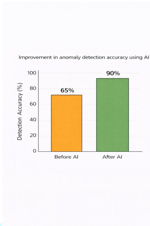
Fig. 3. Improvement in anomaly detection accuracy using AI