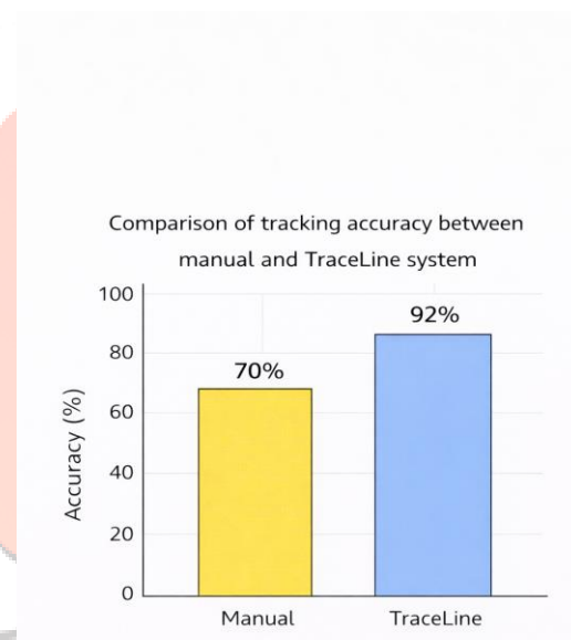
Fig. 2. Comparison of tracking accuracy between manual and TraceLine system

Figure 2 shows the comparison between manual tracking and the proposed TraceLine system in terms of tracking accuracy.