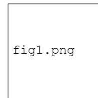
Fig. 1. Example of a figure caption.

example, write the quantity “Magnetization”, or “Magnetization, M”, not just “M”. If including units in the label, present them within parentheses. Do not label axes only with units. In the example, write “Magnetization (A/m)” or “Magnetization {A[m(1)]}”, not just “A/m”. Do not label axes with a ratio of quantities and units. For example, write “Temperature (K)”, not “Temperature/K”.