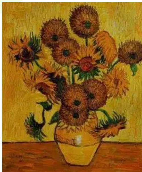
Figure 2: Sunflowers, Vincent van Gogh, 1888

struction is also suggested by the flowers' many stages.