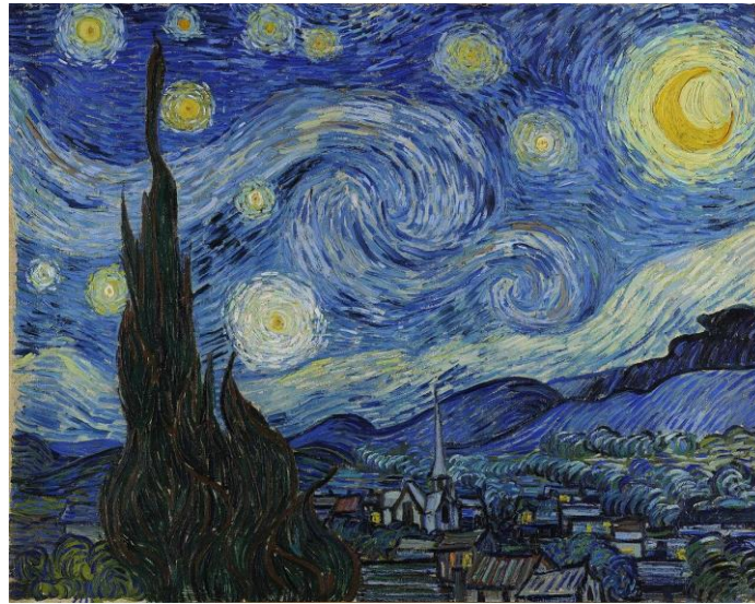
Figure 1: The Starry Night, Vincent van Gogh, 1889 (Source: Van Gogh Museum)