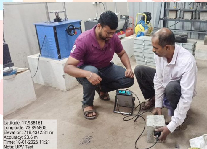
Figure No. 1 UPV testing of specimen

UPV Test: To determine the quality and uniformity of concrete and detect internal flaws and cracks by measuring the velocity of an ultrasonic pulse through the concrete cube. It is non-destructive test conducting after 28 days curing period.