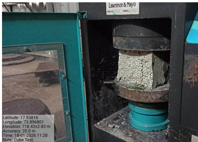
Figure No. 2 Compressive strength testing of specimen