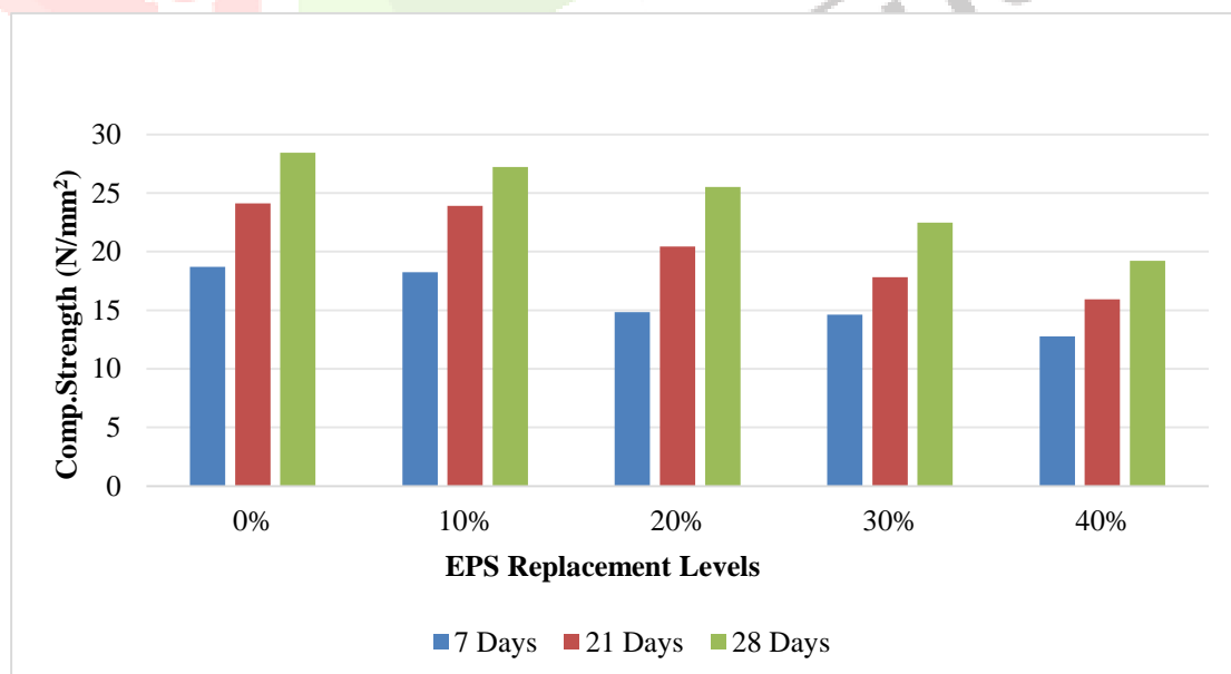
Figure No. 3 Compressive Strength at different stage

UPV values also decreased as the EPS percentage increased, indicating less uniform concrete and more internal voids. Up to 20% replacement, the concrete quality was still considered good, but beyond that, it shifted to medium quality. The relationship between UPV and compressive strength showed that both properties were affected by adding EPS beads.