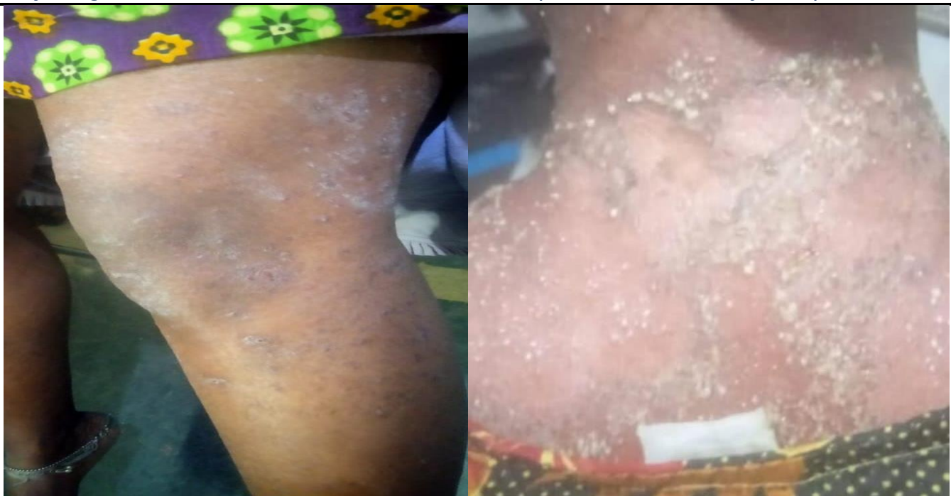
FIG:1 (BEFORE TREATMENT)