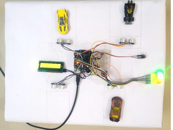
Figure 4.1: Working model