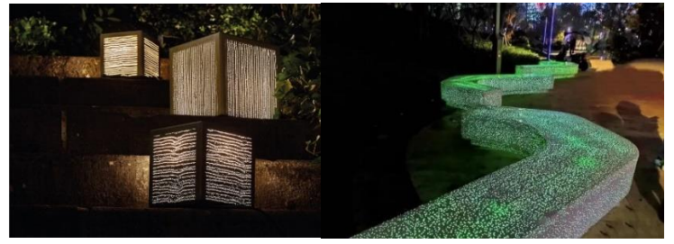
Figure 1: Image of light generating concrete