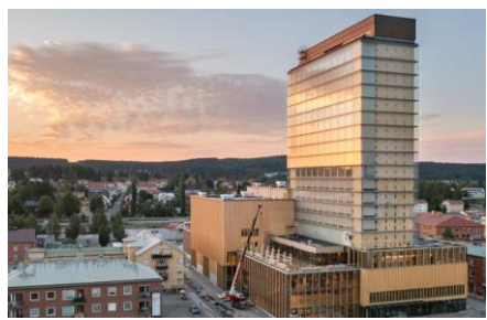
Figure 7: View of the Sara Kulturhus Center, Sweden

This is designed by White Arkitekter, it is built by locally available material cross laminated timber and glulam. It is the nod to that area in history of timber construction. In this we have prefabricated CLT modules used in between two elevator cores and it will held by the strong wooden beam and pillars. This hotel consist of 20 floor and CLT is used for making walls and floors. Infact in the short parts of the building also made from wood frames and beams. This building life span at least 100 years claim by the White Arkitekter.