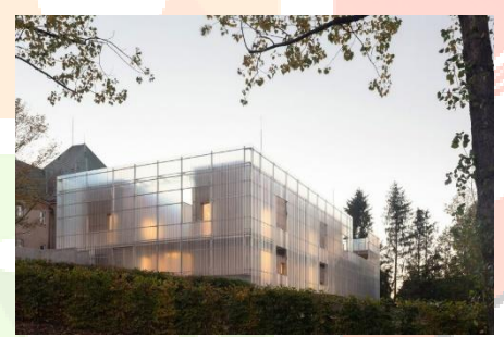
Figure 9: Image of Nova Ruda Kindergarten

This is designed by Petr Stolin Architekt, it has double skiined translucent façade of fiberglass. Inner part of the building is to be covered by the fibre glass with wooden frame, and the whole structure is wrapped by the material of steel and fiberglass shell. The steel structure surrounded the whole building, it has featured with two walkways around with the main sections, and it is concealed from the street view by adding one layer of the trapezoidal fiberglass. This layering of the fiber glass is giving glow behind the outer skin in the night time. With the steel shell the centre part of the building surrounded by the long courtyard, with the walkways and staircases that allow inside movement between to the private garden space with exposed perimeter walkway.