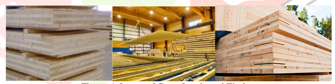
Figure 6: Image of Cross Laminated Timber

It is an engineering wood product that comes in popularity because of its originality, strength and sustainability. It is made by the layering of several pieces of lumber boards. These layers are arranged in a perpendicular to each other which helps the panel's structural morality. It helps to reduce time and cost of construction because it is a prefabricated technique and it can be assembled quickly on site.