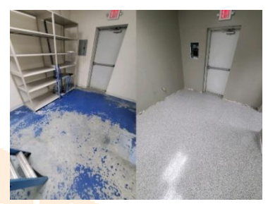
Figure 5: View of the Office area (Port of Houston)

This is an international port in the world for that this is a flooring solution for the 1350 square foot area in their construction and office area because it experiencing a tremendous growth for that need a perfect solution for the flooring. It is a very good option to replace the cement. Definitely this material can replace cement concrete guarantee given by inventors.