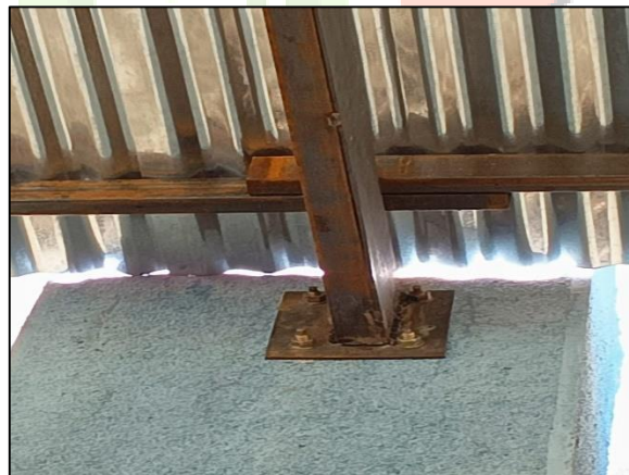
Fig no 6 - Steel Girder With Plates

Figure no 6 represents Girders are structural elements used to support the weight of the building and distribute loads to the columns or walls. In retrofitting, girders may be added or strengthened to enhance the structural integrity of the building. They are typically made of steel or reinforced concrete, providing strength and stability to the structure.