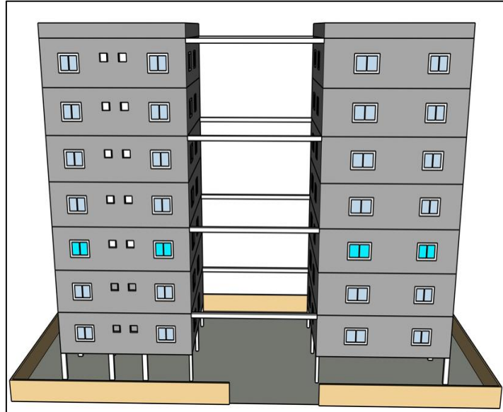
Fig no G+7 With Retrofitting Solution Fig no 10 (Created by Author)

Figure no 10 represent In retrofitting a G+7 building, installing girders strategically at mid-span between floors offers crucial reinforcement. These girders act as supplementary support structures, significantly enhancing the building's resilience against seismic forces. By distributing loads more effectively and minimizing structural vulnerabilities, this approach strengthens the overall integrity of the building. In the event of an earthquake, the presence of these girders helps dissipate seismic energy and mitigate potential damage, thus ensuring the safety of occupants and preserving the structural stability of the building. Additionally, the strategic placement of girders minimizes disruptions to the building's functionality and aesthetics while maximizing the effectiveness of the retrofitting solution. Overall, integrating girders in this manner provides a robust and practical means of enhancing the seismic resilience of the G+7 structure.