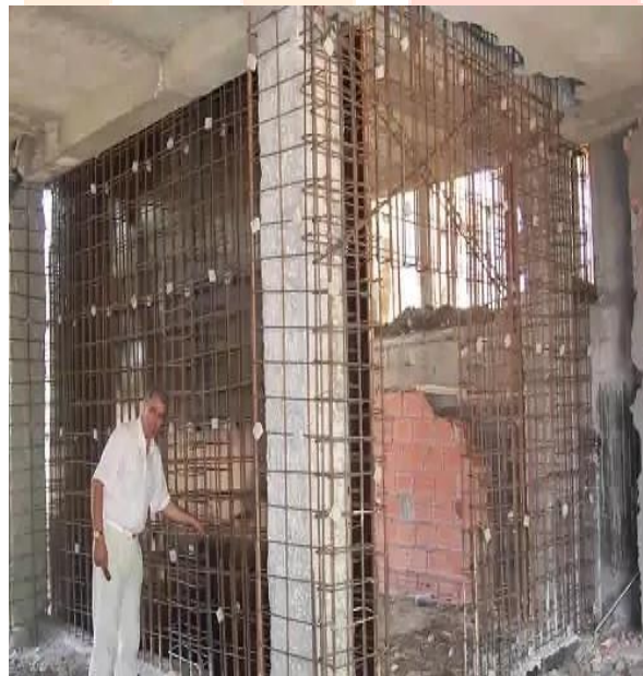
Reinforced Concrete Shear Walls [45]