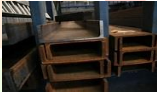
Fig no 8 - Channel Section Plates [34]

Figure no 8 represent Channel section plates, often made of steel, are used to provide additional reinforcement to structural members such as beams, columns, or walls. They are installed to distribute loads more evenly and prevent localized damage or failure during seismic events or other loading conditions. Channel section plates help in improving the overall ductility and strength of the structure without significantly increasing its weight.