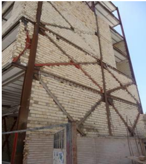
Figur no 4 - Steel diagonal bracing[54]