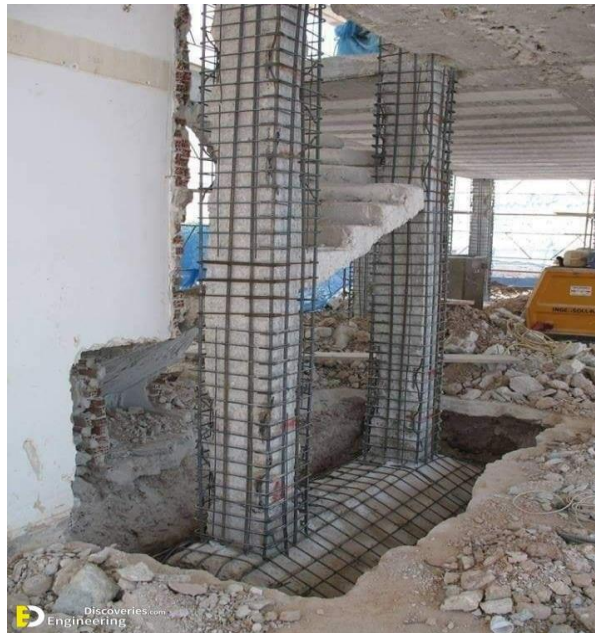
Figure no 2 - Coloumn jacketing [38]