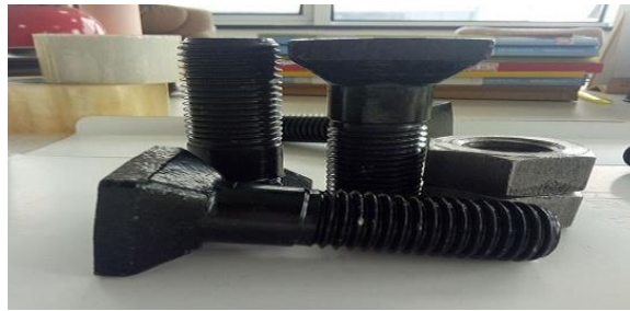
Fig no 7 - Nuts & Bolts [31]

Figure no 7 represent Nuts and bolts are fasteners used to connect different structural components together. In retrofitting, high-strength nuts and ensuring the stability and load transfer between retrofit elements and the original building components.