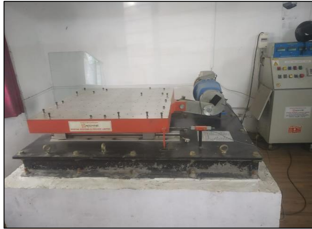
Fig no 5 - Shake Table

Figure no 5 represents An earthquake shake table is a crucial tool for model testing in seismic research. It mimics earthquake motions to assess how structures respond, aiding engineers in designing earthquake-resistant buildings. By subjecting scale models to simulated seismic forces, researchers can study structural behavior and test retrofitting techniques. This experimentation helps enhance the safety and resilience of infrastructure in earthquake-prone regions. Shake tables play a pivotal role in advancing earthquake engineering, contributing to more robust building designs and disaster mitigation strategies.