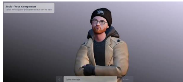
Fig4. User Interface-3

Fig3 and Fig 4 shows different animations of the avatar. Hence, we can see the human like interactions with the avatar enhancing the user experience.