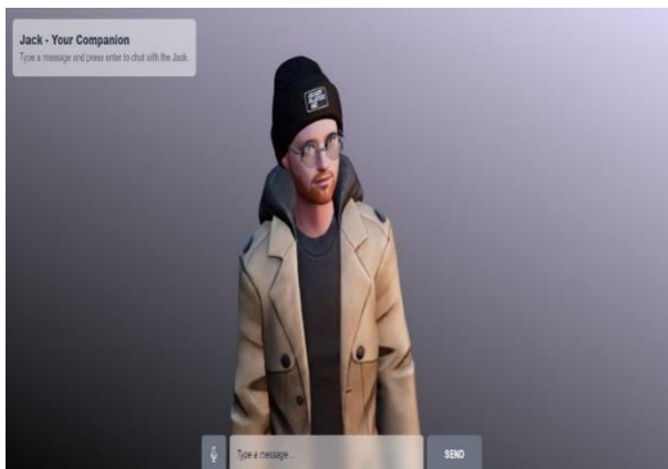
Fig2. User Interface

Fig.2 shows the user interface of the system. Here the users can give their own queries so that the model gives appropriate responses.