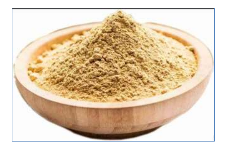
Fig. 1:- Multani Mitti

Multani Mitti are easily available and helps in diminishing pore sizes, removing blackheads and whiteheads fading freckles, soothing sunburns, cleansing skin, improving blood circulation, complexion, reducing acne and blemishes and gives a glowing effect on skin as they contain healthy nutrients. Multani mitti is a best natural source of magnesium chloride.