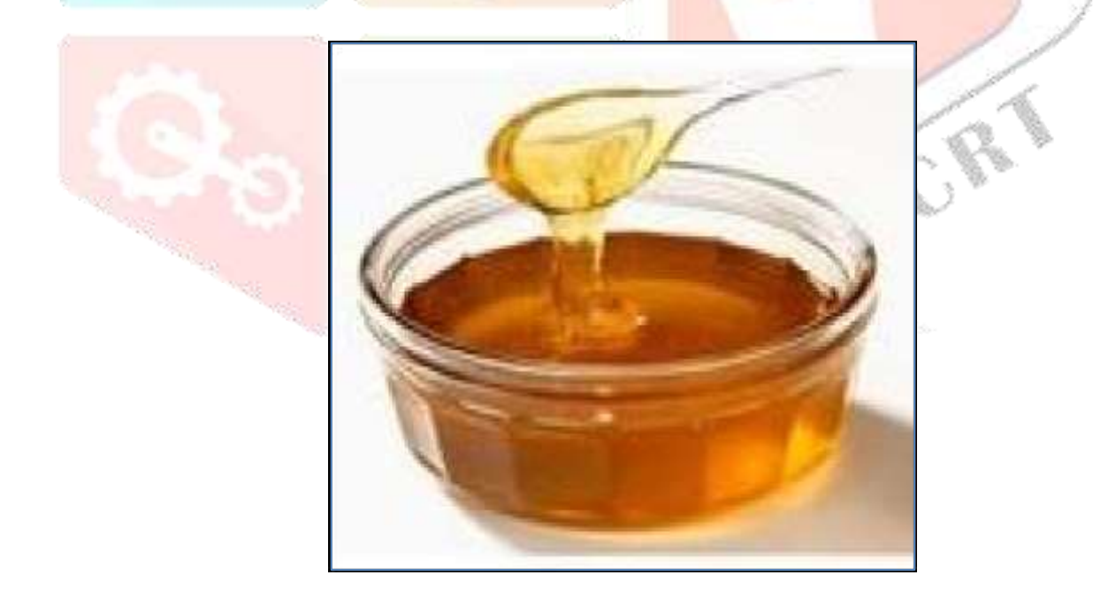
Fig. 8:- Honey

Honey is an Effective Pore Cleanser and Gentle Exfoliator. Honey is naturally antibacterial and exfoliating. These properties make it an effective natural pore cleanser for removing deep-down dirt and debris that may clog the pores and contribute to skin issues.