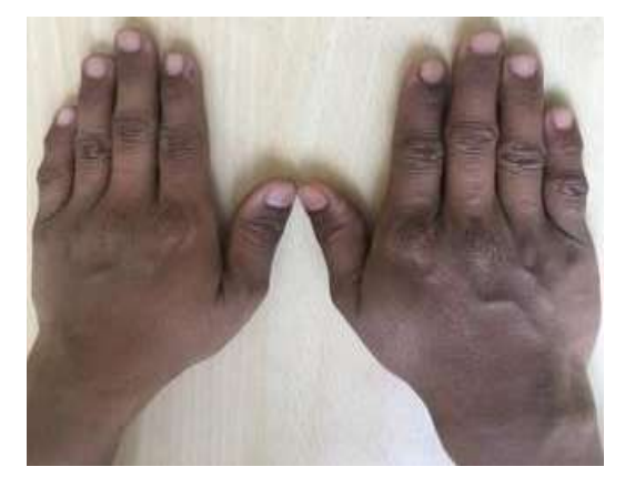
Comparison after application