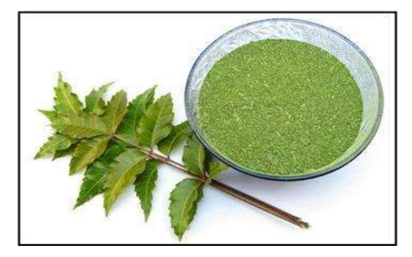
Fig.7:- Neem Powder

It has an anti-inflammatory, antiseptic activity and highly beneficial for oily and acne prone skin. It is commonly used in antibacterial agents.