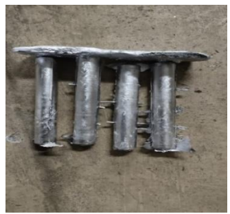
Fig-2 casting specimens