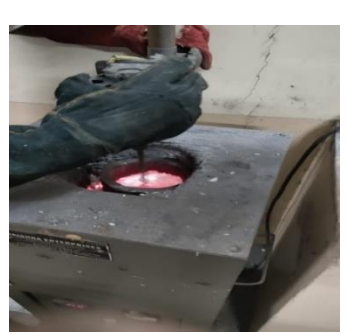
Fig-1 Stir casting

After the fly ash and silicon carbide has been mixed with the molten melt. The molten mixture of aluminium with fly ash and silicon carbide was poured in a predefined cavity with required dimensions. After subsequent cooling and secondary machining processes, different specimens were made for testing of tensile, impact, and flexural.