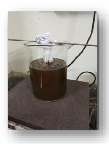
Image No. 4 Colour change after dipping of Tuttha pottali in Gomutra.