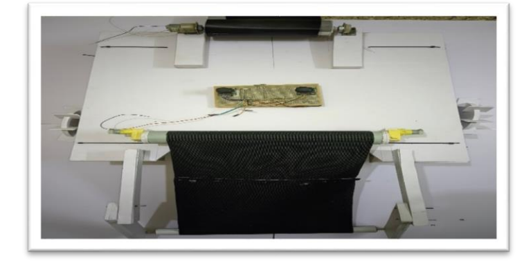
Fig (2) Top view

The AquaGuard uses a 12V battery as its power source, which guarantees a dependable and sustainable energy for prolonged source operation. Two nRF24L01 modules enable communication between the transmitter and receiver, which adds to the reliability and effectiveness of the wireless control system. The transmitter interface has two joysticks that provide easy control over the boat's motion and two switches that let the operator regulate the oil and rubbish conveyors separately. This wellthought-out control system guarantees that the AquaGuard can be maneuvered precisely to navigate difficult marine situations and effectively fulfill its dual mission. Modularity and efficiency were given top priority during the project's design phase, which resulted in the use of DC motors for their dependability and accuracy in operating the boat's many systems