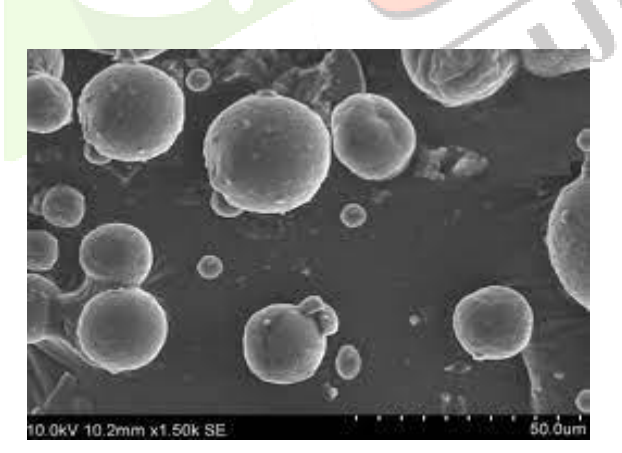
fig:3 floating microsphere

4) Floating microspheres : These microspheres stay buoyant in the stomach without influencing the rate of gastric emptying because their bulk density is lower than that of gastric fluid. If the system is floating on stomach content, the drug is released gradually at the intended rate, increasing gastric residence and fluctuating plasma concentration. Additionally, it lessens the likelihood of dosage dumping and striking. It also results in a longer-lasting therapeutic impact, which lowers the frequency of dose. Ketoprofen is administered using this method.