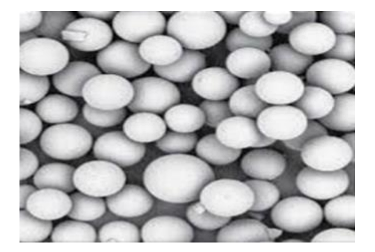
fig: 4 radioactivr microsphere

distance rather than releasing radioactivity from microspheres. The three types of radioactive microspheres are \alpha , \beta , and \gamma emitters