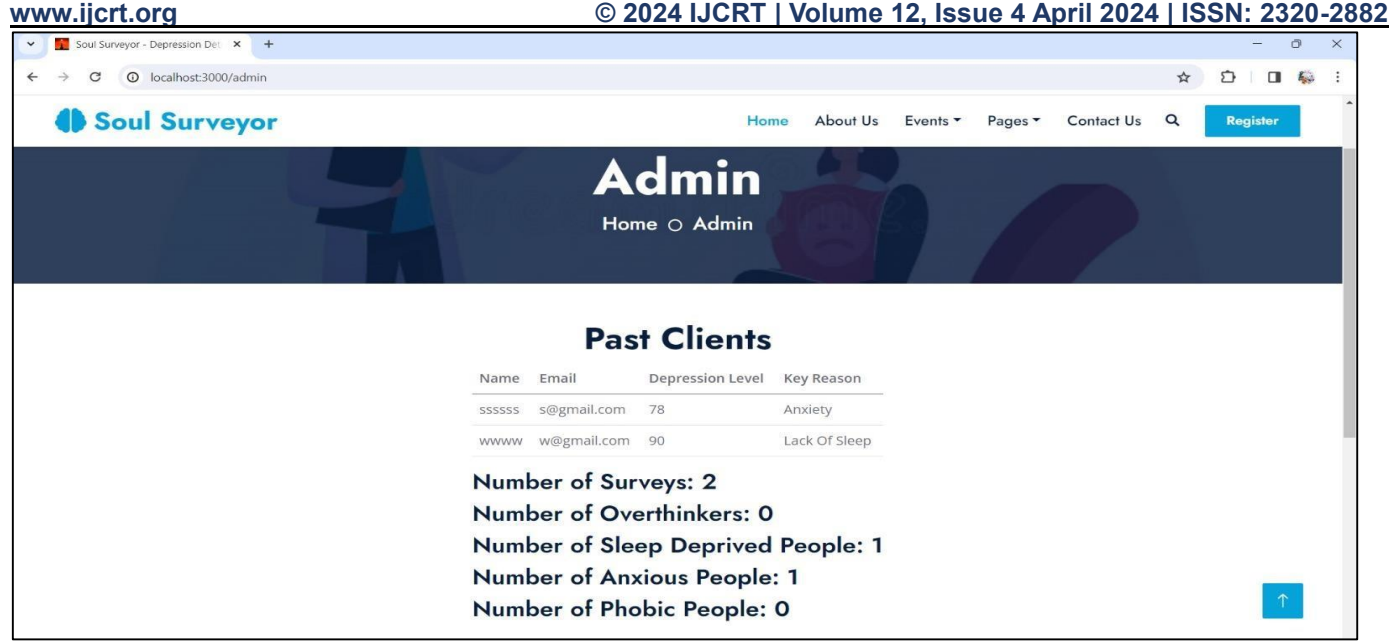
Fig 5.4: Past client history

Figure 5.4 It individually states the total number of Surveys taken, Number of Overthinkers, Number of Sleep Deprived People, Number of Anxious People, Number of Phobic People.