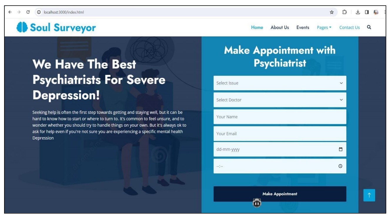
Fig 5.1: Appointment Page

Figure 5.1 Appointment Page wherein the Severely Depressed people can book an appointment for consulting the counsellor or psychiatrist. Here the user has to enter his details in the form as shown in the figure and book the appointment.