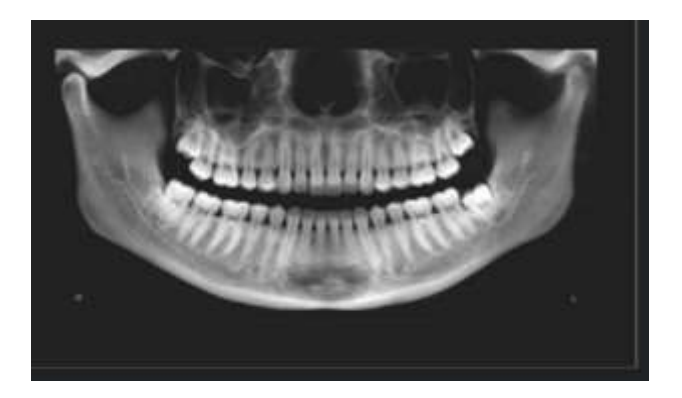
Fig: Panoramic radiograph

Epstein et al consider the clinical findings of greater relevance than panoramic images for patients with TMD.<sup>[7]</sup>