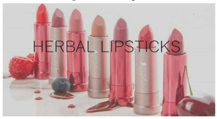
Fig.2- Herbal Lipstick