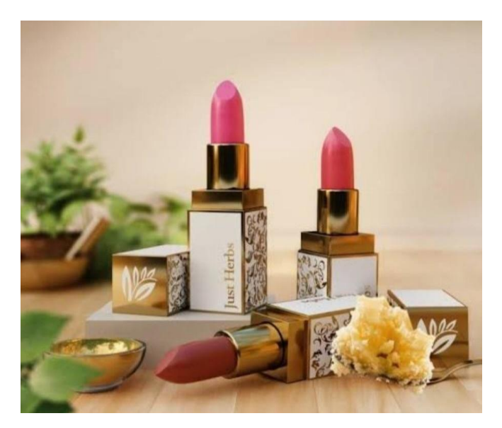
Fig.3- Just Herbal Lipstick

Lipstick is a cosmetic product containing pigments, oils, waxes, and emollients that applies color and texture to the lips, There are many varieties of lipstick, Lippy is a common Britishword for lipstick.