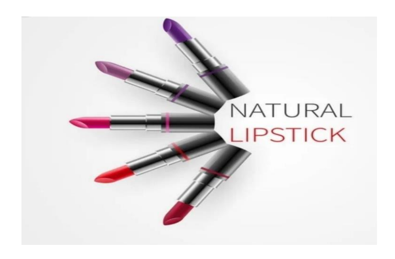
Fig.1- Natural Lipstick

lipstick are dangerous to human on consumption and may cause adverse effect such as allergy, dermatitis, skin discoloration, drying of lips, etc. In some cases they can be carcinogenic and even fatal. This limitation thus leads the use of natural colorants in production of lipstick. Natural colors are extracted from natural sources plants, insects and algae.<sup>4</sup>