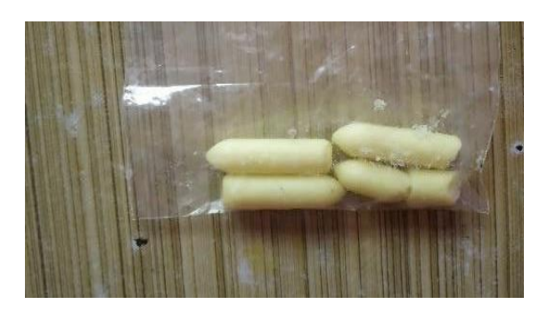
Fig – F1 Formulation of herbal lipsticks