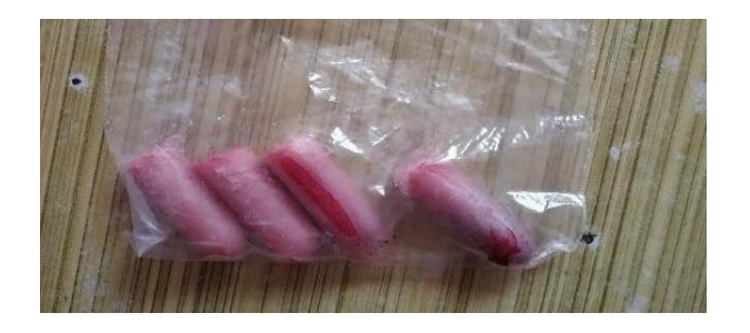
Fig – F4 Formulation of herbal lipsticks Table no 9- Formulation 5