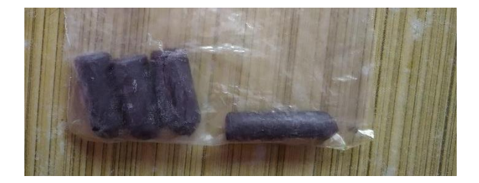
Fig – F5 Formulation of herbal lipstick