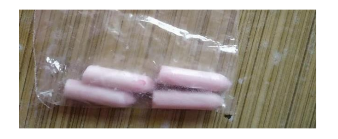
Fig- F2 Formulation of herbal lipsticks