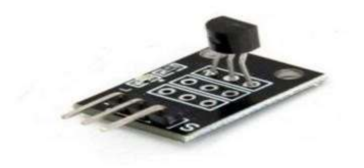
Fig 4: DS18B20 sensor

Track soil humidity and soil temperature levels for a comprehensiveunderstanding of the atmosphere.