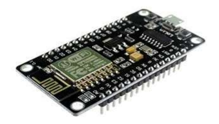
Fig 1: NodeMCU ESP8266

At the heart of the intelligent farming system is the NodeMCU microcontroller. It serves as the central processing unit, connecting sensors, and facilitating communication with the Ada fruit IO platform. NodeMCU is chosen for its compatibility with the ESP8266 Wi-Fi module, making it suitable for IoT applications in agriculture.