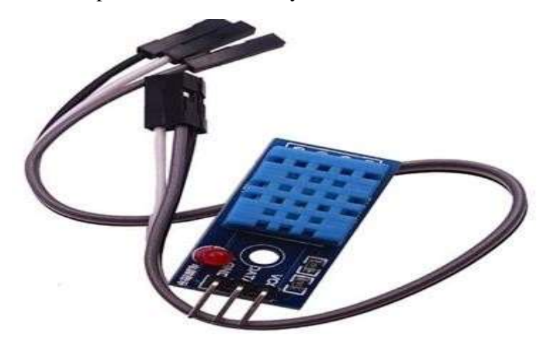
Fig 3: DHT11 sensor

Measure ambient temperature and Humidity to assess environmental conditions.