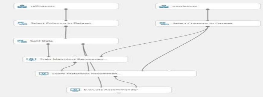
Fig. 5 Structure of the complete model

The evaluation module compares the test dataset ratings with the predicted ratings of the scored dataset. It offers some metrics about the results, namely the mean absolute error (MAE) and the RMSE. The results of the evaluation are presented in figure 6.