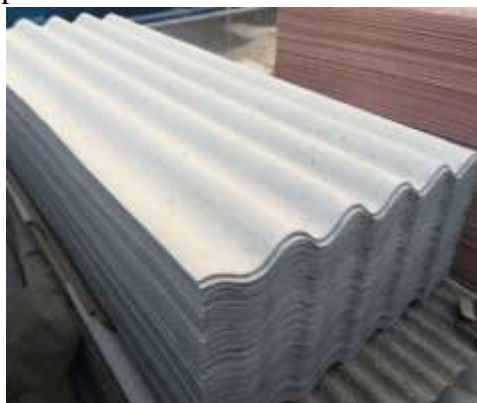
Figure 1. Asbestos Cement Sheet.

Asbestos cement sheet, a composite building material combining cement and asbestos fibers, gained popularity in the late 19th century due to affordability, fire resistance, and availability. Its versatility in flat and corrugated sheets makes it a popular choice in construction.