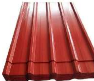
Figure 5. Color-Coated Aluminum Roofing.

Aluminum roofing sheets, color-coated for environmental resistance, longevity, and aesthetic appeal, are commonly used in the construction sector for roofing and cladding due to their lightweight and corrosion-resistant properties, and are coated with protective paints like polyester, silicone, or PVDF..