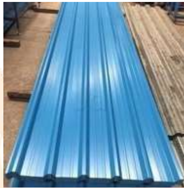
Figure 2. Pre-painted galvanized sheet (PPGI).

Galvanized steel that has been painted or coated with another organic substance is called pre-painted galvanized sheet, or PPGI (Pre-Painted Galvanized Iron Sheet). This method gives the galvanized sheet more visual appeal and protection against corrosion.