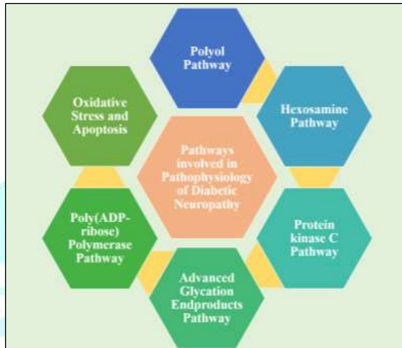
Figure 3: Pathophysiological pathways involved in Diabetic Neuropathy

Poly(ADP-ribose) polymerase (PARP) is an enzyme found in the nucleus that's crucial for repairing DNA and has several other important functions. It's often used as a marker for diabetic peripheral neuropathy (DPN) (Adki & Kulkarni, 2023). Among its types, PARP-1 is the most prevalent and plays a key role in fixing DNA and preserving the genome's integrity. Beyond this, PARP-1 also influences how the body responds to inflammation, cell death, and other critical processes by regulating the expression of various proteins at the transcriptional level (Pacher & Szabó, 2005).