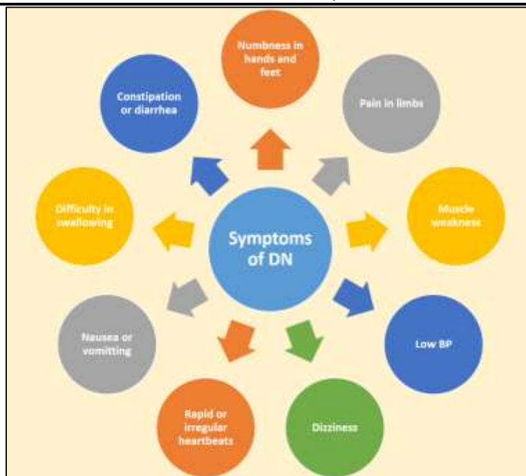
Figure 2: Symptoms of Diabetic Neuropathy