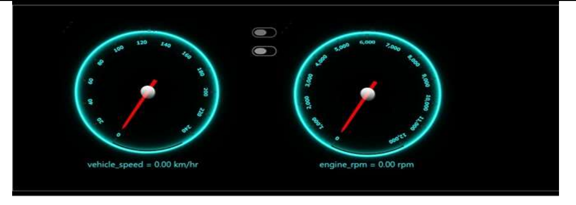
Fig 3 : Before simulation

Fig 4 shows the panel after simulation starts. Whenever the ignition switch and throttle position are ON the speed and RPM values in the panel changes. Also the economy, power and over speed indications will also glow according to the range of speed given in the database.