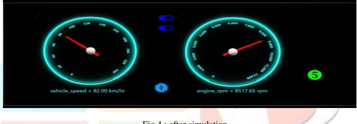
Fig 4 : after simulation

Fig 4 shows the panel after simulation starts. Whenever the ignition switch and throttle position are ON the speed and RPM values in the panel changes. Also the economy, power and over speed indications will also glow according to the range of speed given in the database.