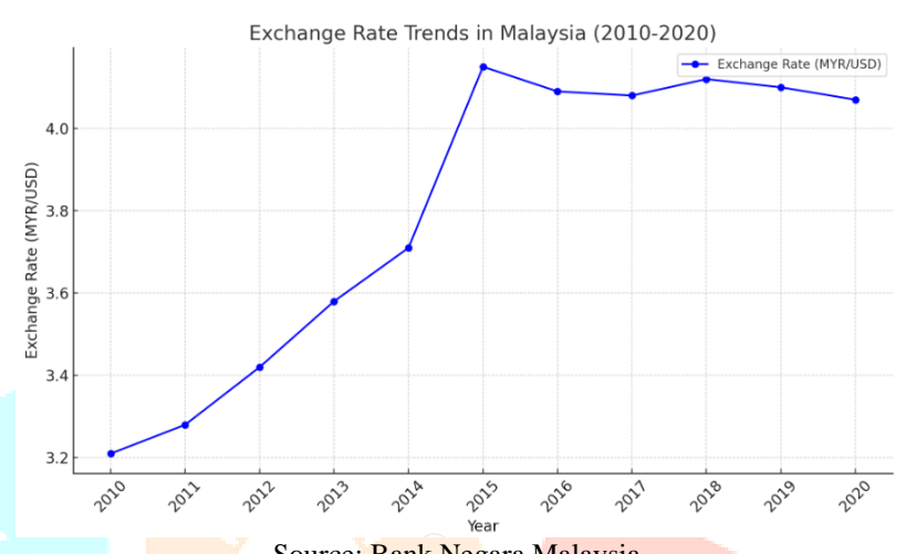
Figure 2: Exchange Rate Trends in Malaysia

Here is the requested figure regarding the exchange rate trend in Malaysia from 2010 to 2020: