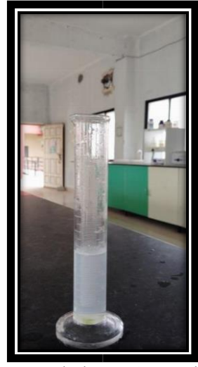
High-Temperature Stability: - The soap was allowed to stand above 40° Celsius. In heating Mantle