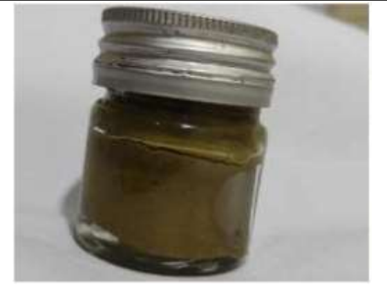
Fig No :- 5. Anti- inflammatory cream