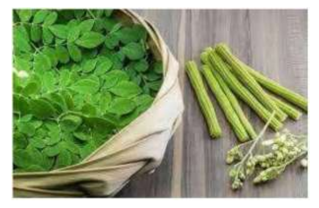
Fig no :-2. M. Oleifera plant