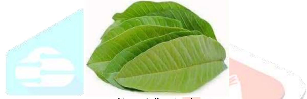
Fig no :-1. P. guajaya leaves