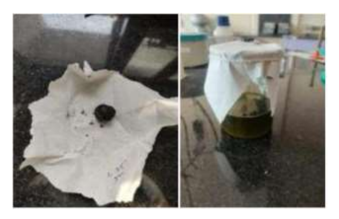
Fig no :- 3. Extraction of Guava & Drumstick using soxhlet apparatus

The leaves samples which are required for experiment is collected from resendential area of karad. The leaves were kept for drying four to five days and the powder is made using cutter mill. Collected plant material recognized and authenticated by Department of Botany, Yashwantrao Chavan College of Science, Karad.