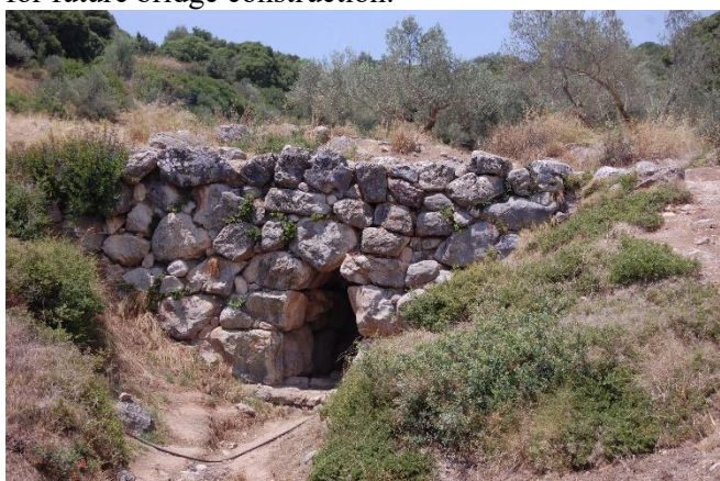
bridge designs adopted 1.These were Mesopotamian, Egyptian and Greek civilizations. 2. Their construction gives a glimpse of life during an era when trade was just flourishing.

In ancient times before 1000 BCE, civilizations developed basic yet functional bridge designs using materials like wood, stone, and early metals. These included corbel arch bridges, clapper bridges made of stone slabs, log bridges, and trestle bridges. Famous examples include the Pont du Gard in France and the Aqueduct of Segovia in Spain. These ancient structures demonstrated early engineering skills and set the stage for future bridge construction.