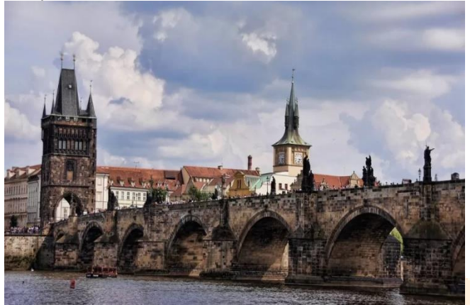
Charles Bridge in Prague (Baroque) /Reference: Time Out