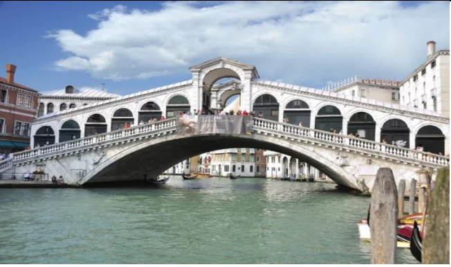
The Rialto Bridge in Venice (Renaissance)