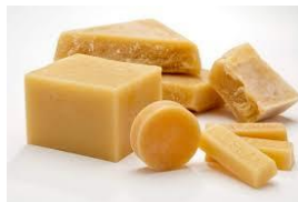
Fig 1: Beeswax