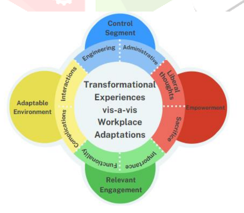
Figure 1. Transformational Experiences vis-a-vis Workplace Adaptations

This study identified the adaptations of utility workers during the pandemic. With the great impact of COVID-19 on all the workers in Qatar, the utility workers in school were also greatly impacted from their school timing down to their sanitation routine. This phenomenological study exhibited the prime factors of the adaptations of utility workers to answer the questions: What adjustments did the utility workers encounter when they started to work in PSD during the pandemic? And, How did the utility workers handle these adaptations? The adaptations of utility workers led to the four core elements of transformational experiences: Control Segment, Adaptable Environment, Relevant Engagement, and Empowerment. These major themes could be abbreviated to an acronym of "CARE" with its underlying sub-themes: for Control Segment-Engineering and Administrative; for Adaptable Environment-Complications and Interactions; for Relevant Engagement-Importance and Functionality; and for Empowerment-Liberal Thoughts and Sacrifice of the utility workers.