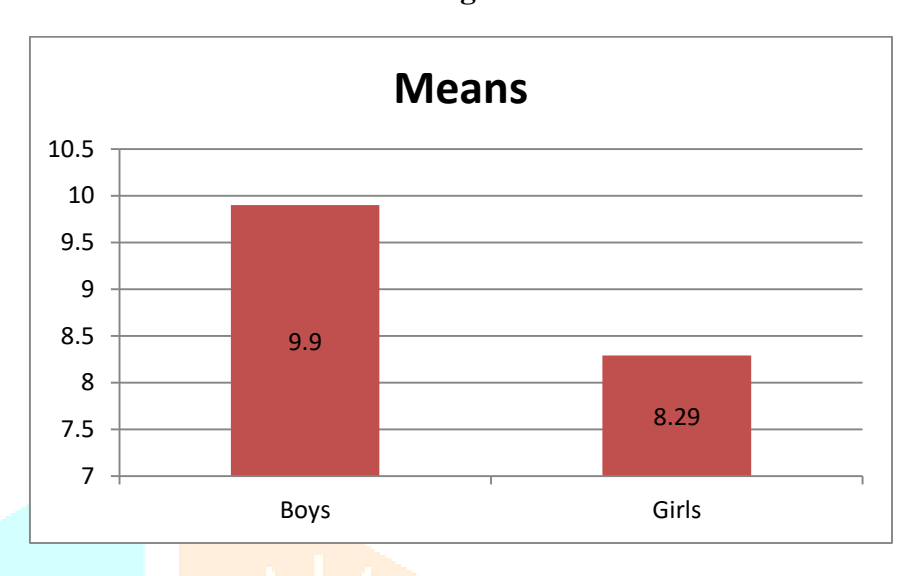
Figure 2: Bar graph showing difference between means of Problem Solving Ability of Adolescent boys and girls

too so it may be further concluded that boys have higher ability of problem solving then their female counterparts.