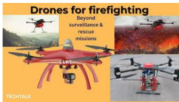
Fig: Drones for Firefighting

The project involves developing a prototype automatic sensory firefighting drone, integrating advanced sensors and autonomous navigation algorithms for real-time data collection and firefighting operations. Collaborating with experts in engineering and firefighting, specifications are defined to meet operational needs. The drone's design includes components such as airframe structure, propulsion systems, and firefighting mechanisms like water or foam dispensers. Testing assesses flight stability, sensor accuracy, and effectiveness in simulated scenarios, aiming to enhance firefighting efficiency and safety in challenging environments.