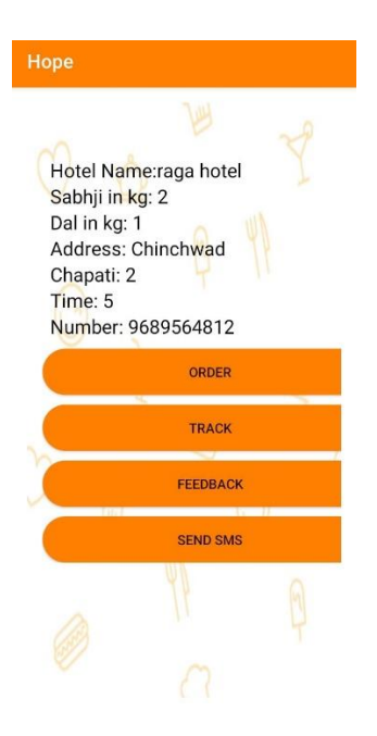
Fig: Show Food

NGOs can log in to the system to view the surplus food items available for donation. They can see details such as the hotel name, type of food, quantity, time and phone number etc.