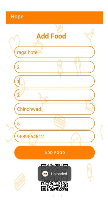
Fig. add food