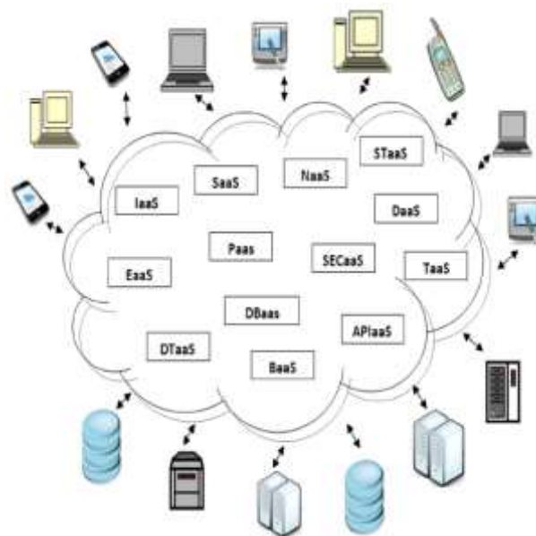
Figure 1. Cloud Computing Diagram