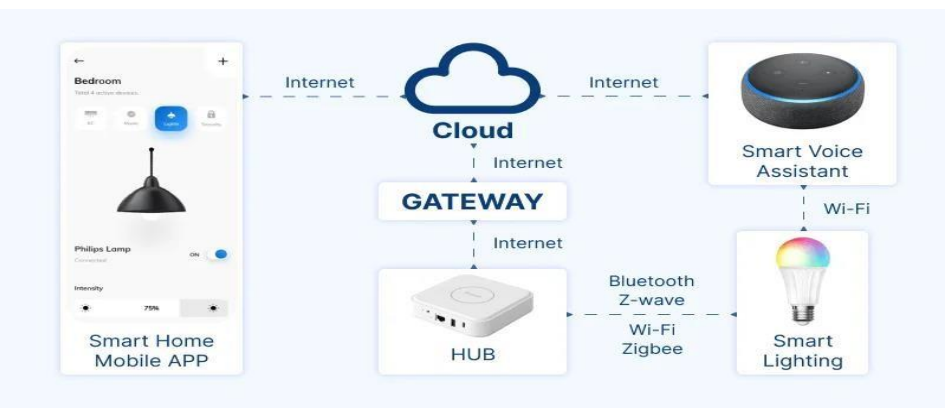
Fig 3: Smart lighting system connected to an IoT gateway

Smart home protocols, built-in apps, and IoT gateways will convey commands sent from the cloud server to the subdevice network; the IoT gateway can also be used to relay the sub-device's status back to the server. As a result, you can conveniently control the Internet of Things smart lighting system whenever and wherever you like, using your laptop or smartphone.