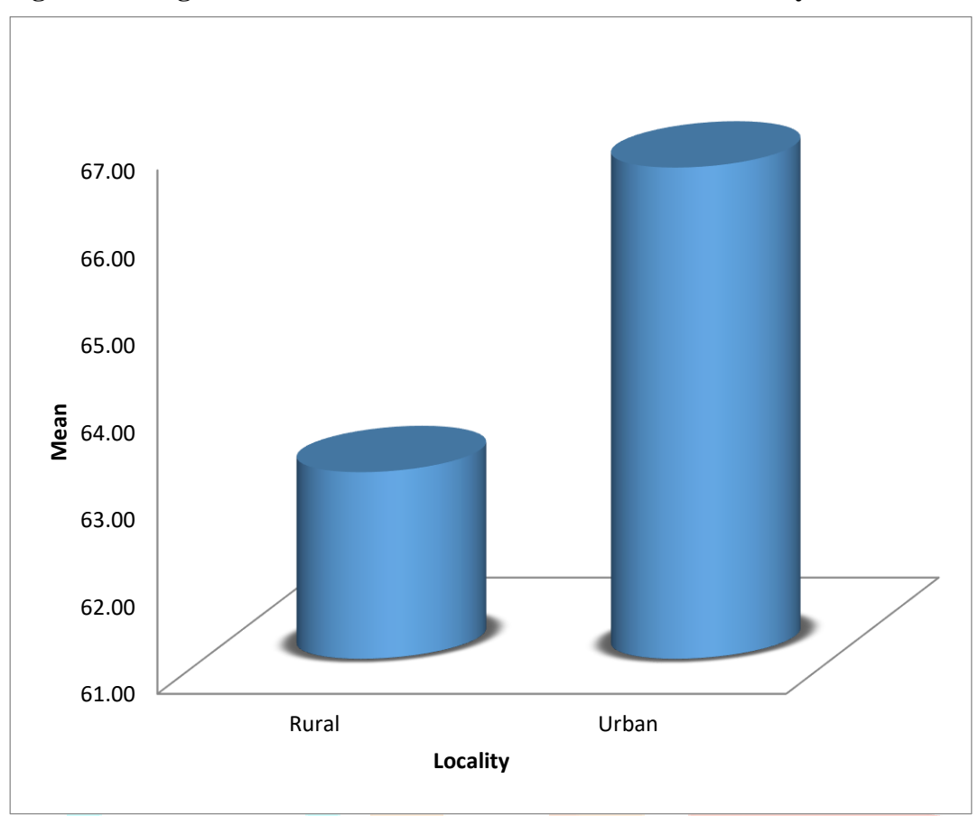
Fig.2: Bar diagram shows the mean score of the variable Locality