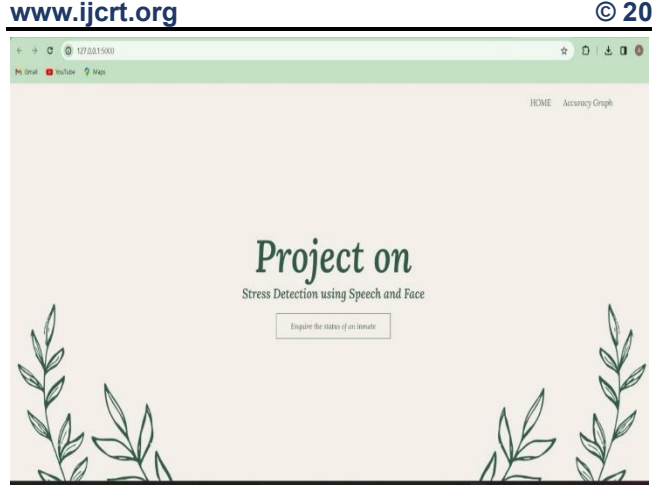
FIG.2 Home page