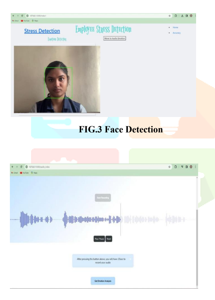
FIG.4 Audio recognition