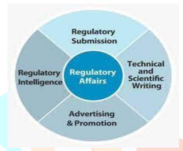
Fig.1 Drug Regulatory Affairs

Most businesses have specialized departments of Regulatory Affairs personnel, regardless of whether they are large, multinational pharmaceutical corporations or tiny, creative biotechnology enterprises [3].