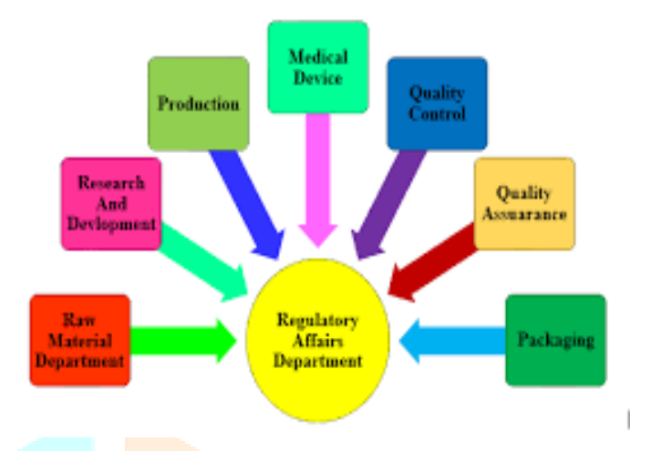
Fig.2 Experts in regulatory affairs