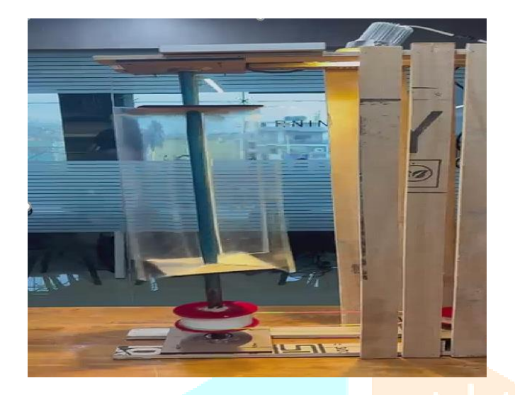
Fig.2: Outcome of Hybrid Generation in Highways

Study indicates that integration of VAWTs and solar panels along highways can yield substantial energy production. Combination of wind and solar resources ensure continuous energy generation, with potential to meet a significant portion of electricity demand for highways infrastructure. Environmental benefits, including reduce carbon emissions and dependence fossil on fuels, highlights sustainability advantages of this approach. This project generates single phase 230V of voltage with 80% of efficacy.