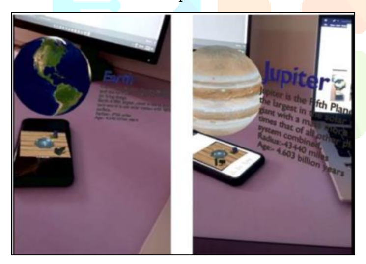
Fig. 2 3D Models in AR

Overall. the results demonstrate the effectiveness of Learniverse in enhancing student learning outcomes, engagement levels, and overall educational experiences. The integration of interactive AR and VR content delivery, along with optimization for low-specification devices, has revolutionized the learning process, empowering students to reach their full potential.